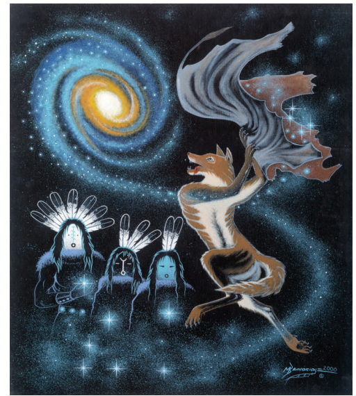
Coyote Tosses the Stars and Creates Chaos, one of the original paintings from "Sharing the Skies"